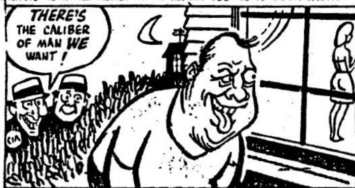
Daily World (Communist) 8-16-69

CIA RECRUITER SAID "WE ARE NOT INTERESTED IN THE MAN WHO WANTS TO MAKE MONEY - WHAT REALLY COUNTS IS MOTIVATION."